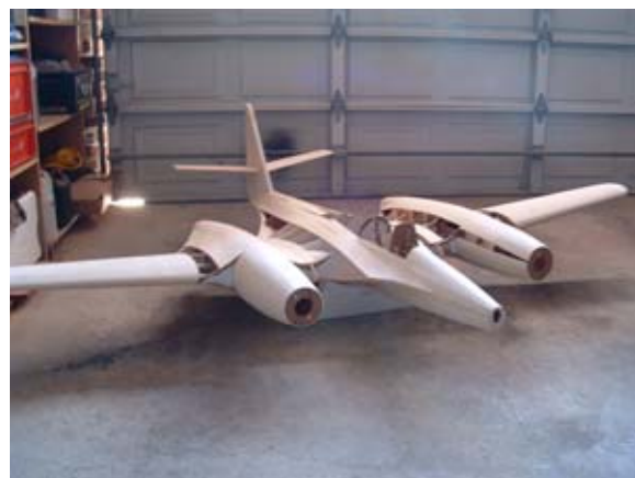
Present stage of progress on the Moonbat.