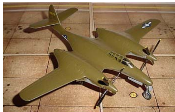
A finished model of the Moonbat.

electric brakes (bought from Hobby-Lobby) on the two main wheels. Besides finishing the model he still has to make a mould for the canopy and engine spinners.