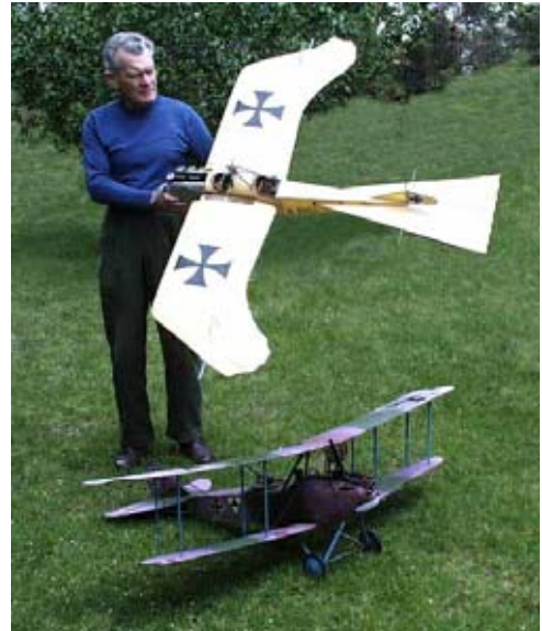
I don't know if Gary still has the Be2 but he still flies scale free flight models and is shown, a little older and greyer, with two more recent productions.