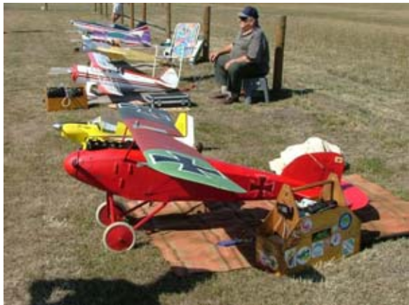
The other side of the pits.