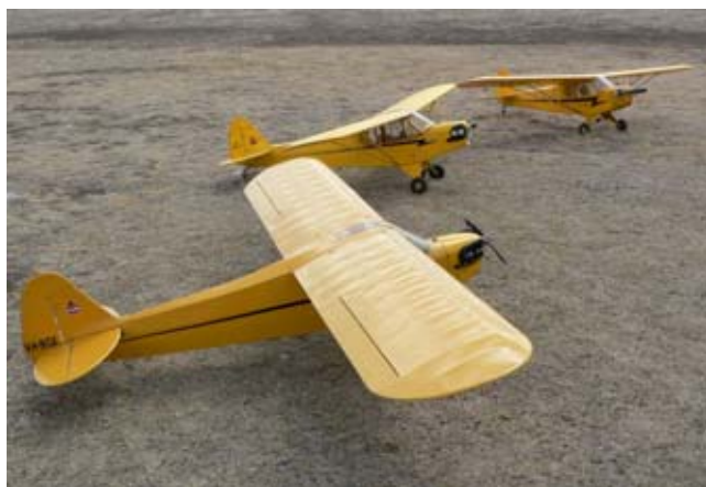
The old reliable Piper J3 Cubs were popular on the day and flew well in the wind.