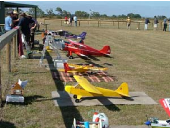
One side of the pits line up.