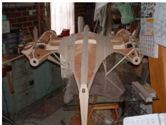
Ivan's model in the early framing stage.