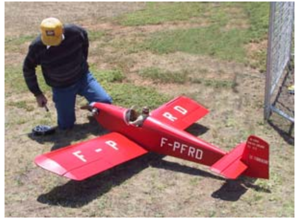
Anthony is still flying his relic after many rebuilds due to repeated failures of the old Kraft radio system. It now flies with more modern control equipment and, as can be seen, it really is red with white trim!

Extracts from Airborne magazine March-April 1984 presented by Frank Curzon.