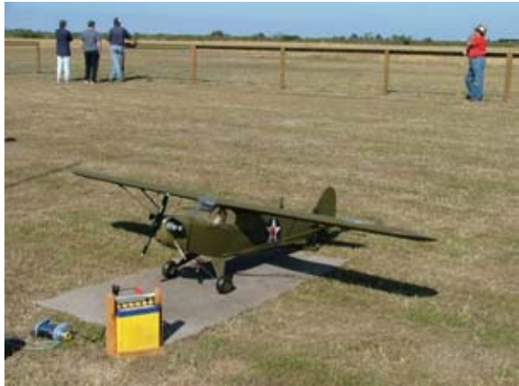
Ron Paine flew this Piper L4 in Military flying.